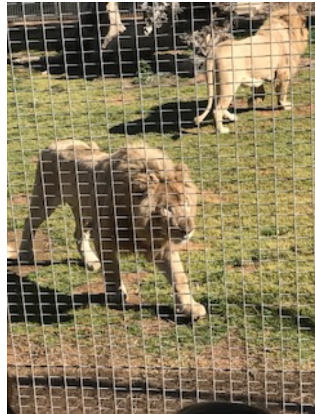
Kimba, a male White Lion

On Friday, students in Years K-2 went on their excursion to Altina Zoo. I wish I was able to record their excited comments when they saw the lions, giraffes, zebras, hyenas, monkeys and all the other exotic animals. Students enjoyed learning about where the animals had come from, their diets and their habitat. It was a great day had by all.