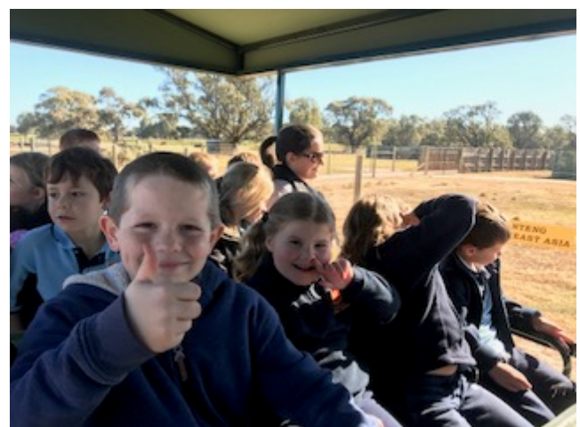
Students on their horse & cart tour of the Zoo