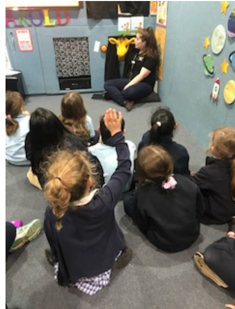
Kinder and Year 1 learning all about what makes a good friendship.