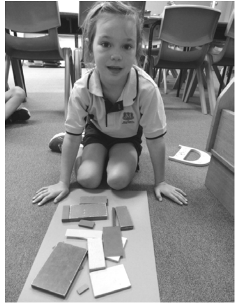
By the number of sides