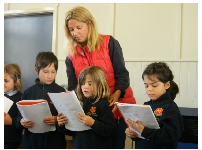
Delivering quality and excellence in education