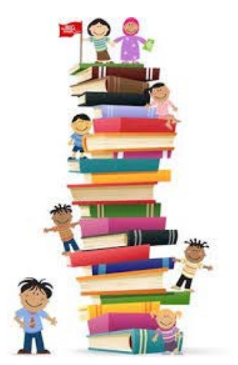
Delivering quality and excellence in education

Successful teaching and learning to address student needs in relation to literacy and numeracy requires the teacher to have an understanding of where the student is now and where the student needs to go next in their literacy and numeracy development.