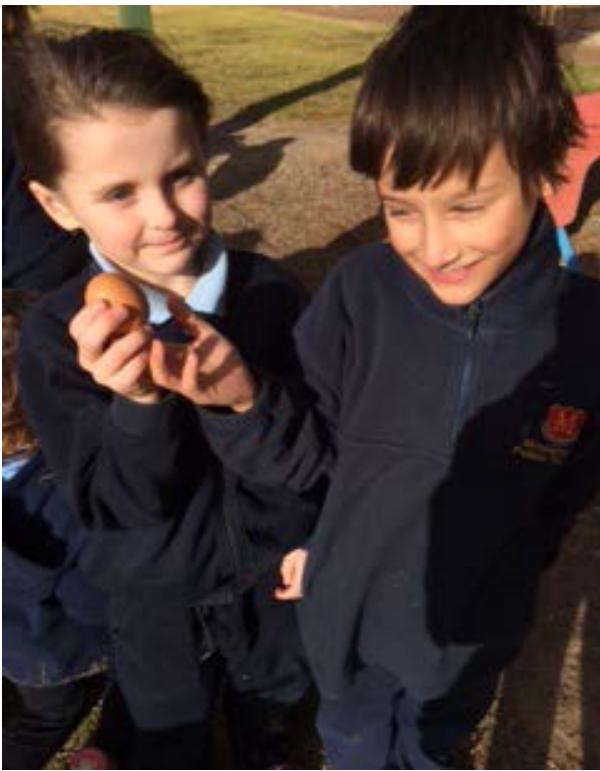
Rightly so! It survived. Poached eggs, anyone?