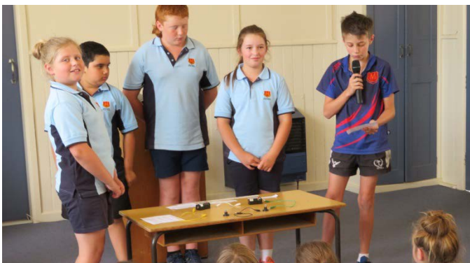
Year 3-6 with their electrical circuit.